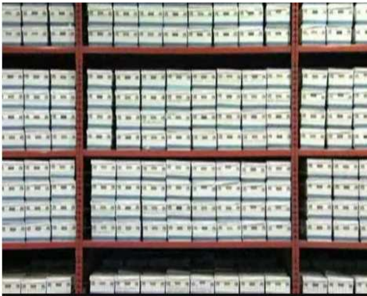
Figure A2 Arrangement of paper storage in Iron Mountain Inc. storage facility

Reference : Iron Mountain Inc. Website Video Tour www.ironmountain.ca/en/services/tours/