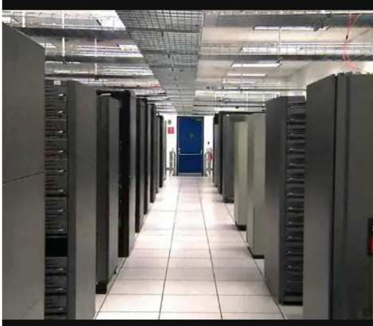
Figure A1 Inside view of Iron Mountain Inc. storage facility